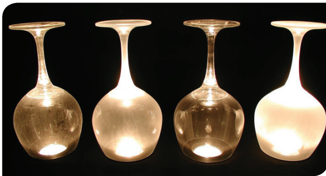
AA/MA Copolymer AA/AMPS Copolymer Alcoguard 4160 No polymer added